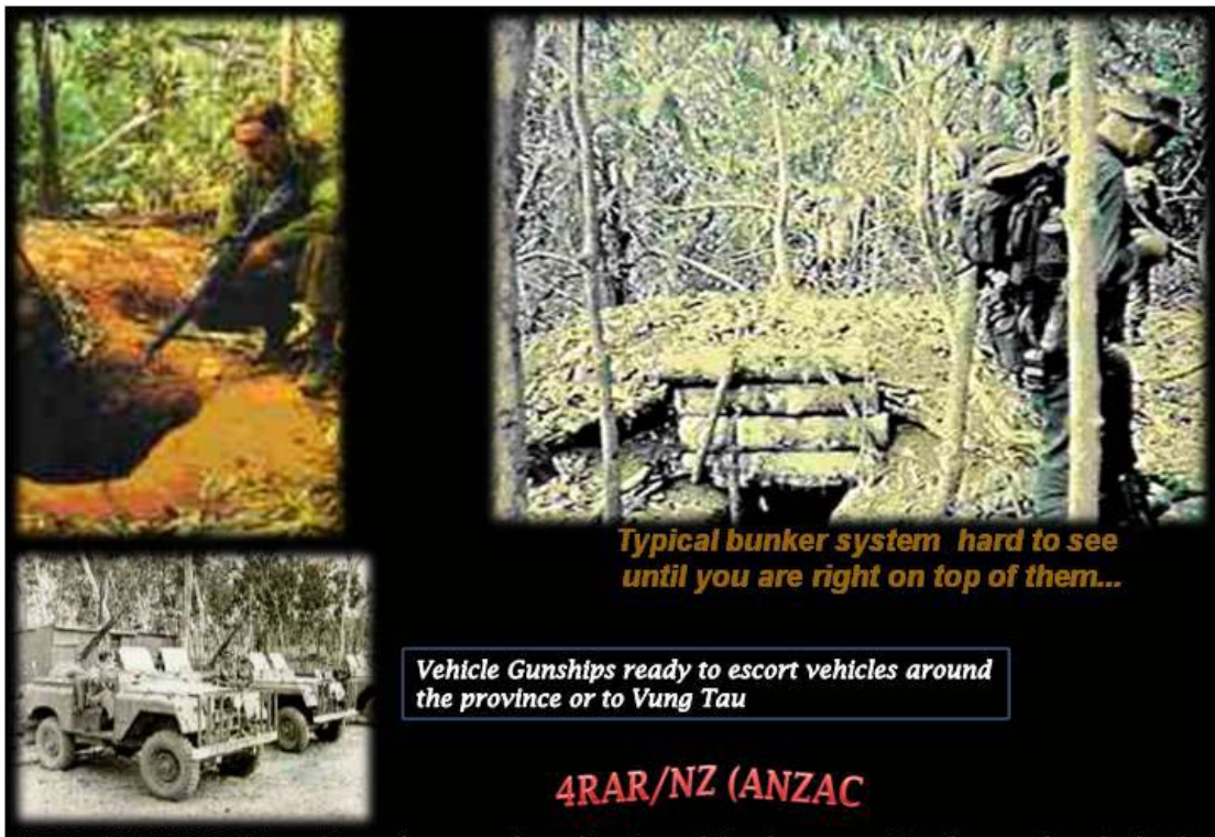
4 RAR / NZ (ANZAC) Battalion, after a week settling in and "in theatre training", moved to the bush for the remaining seven and a half months of its tour. This meant the soldiers spent their tour entirely on operations during the monsoon season