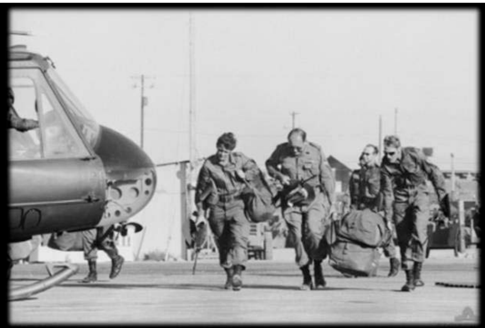
South Vietnam. December 1971. Troops of 4RAR /NZ (ANZAC) (The ANZAC Battalion comprising 4th Battalion, The Royal Australian Regiment and a component from the 1st Battalion, Royal New Zealand Infantry Regiment), move towards a RAAF Iroquois helicopter for their last helicopter flight in Vietnam. The flight took them aboard HMAS Sydney which is now on its way to Australia. The departure of 4RAR /NZ (ANZAC) left behind at Vung Tau logistic elements of the Australian Force to complete the cleaning and packing of stores and equipment for their return to Australia during the next few months.