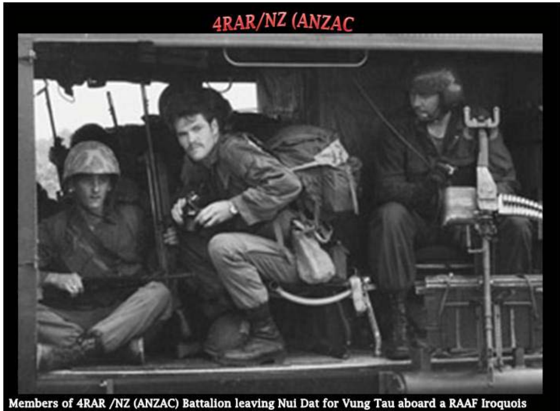
Members of 4RAR /NZ (ANZAC) Battalion leaving Nui Dat for Vung Tau aboard a RAAF Iroquois helicopter at the end of their combat role in Vietnam, November 1971.