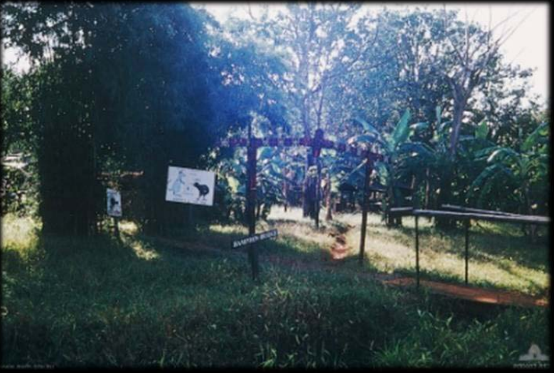
4RAR /NZ (ANZAC) (THE ANZAC BATTALION COMPRISING 4TH BATTALION, THE ROYAL AUSTRALIAN REGIMENT AND A COMPONENT FROM THE 1ST BATTALION, ROYAL NEW ZEALAND INFANTRY REGIMENT) V COMPANY LINES. Vietnam; Vietnam: Phuoc Tuy Province, Nui Dat