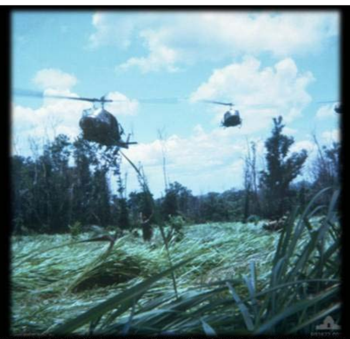
Three Bell UH-1 Iroquois helicopters approaching a landing zone during Operation Hawkesbury, a reconnaissance in force operation that was conducted about twelve miles to the north and northwest of the 1st Australian Task Force (1ATF) base at Nui Dat. The operation was conducted by 1 Battalion, The Royal Australian Regiment (1RAR) and 4RAR /NZ (ANZAC) (the ANZAC Battalion comprising 4 Battalion, The Royal Australian Regiment and a component from 1 Battalion, Royal New Zealand Infantry Regiment).