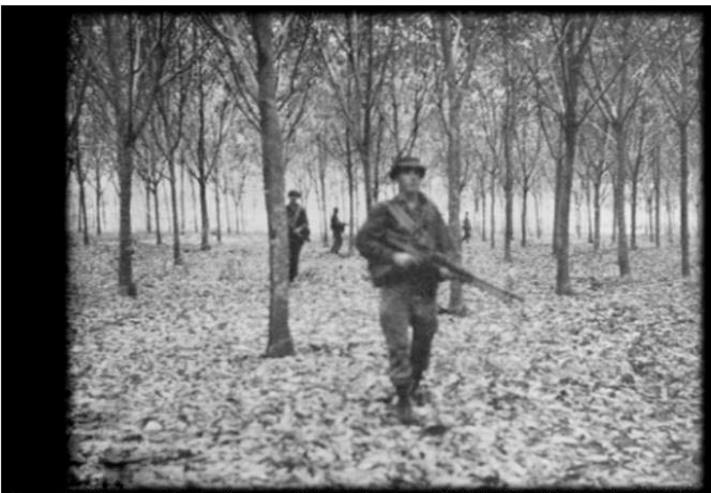
Phuoc Tuy Province, South Vietnam. 1968-06. Members of 4RAR /NZ (ANZAC) (The ANZAC Battalion comprising 4th Battalion, The Royal Australian Regiment and a component from the 1st Battalion, Royal New Zealand Infantry Regiment), sweep through the Binh Ba rubber plantation a few miles north of the 1st Australian Task Force (1ATF) Base at Nui Dat. The battalion was on its first operation after arriving in South Vietnam.