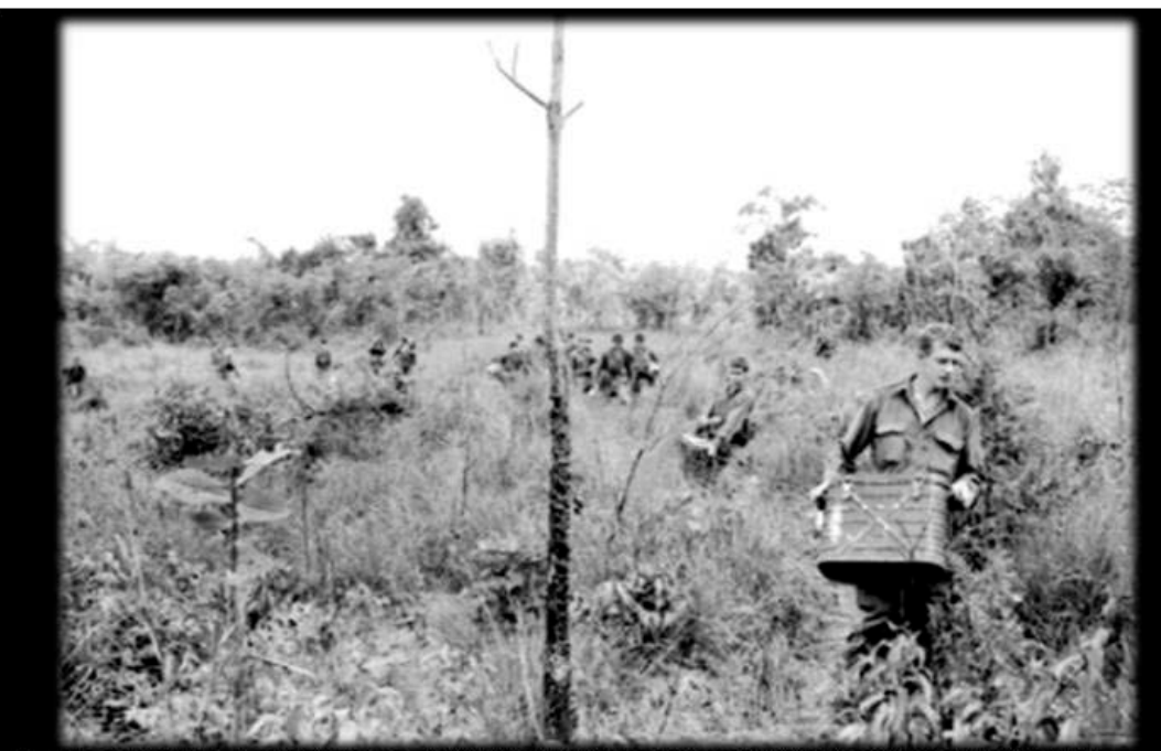
Bien Hoa Province, South Vietnam. 1968-07. A welcome resupply for members of 4RAR /NZ (ANZAC) (The ANZAC Battalion comprising 4th Battalion, The Royal Australian Regiment and a component from the 1st Battalion, Royal New Zealand Infantry Regiment), while on operations in Bien Hoa Province, as they unload their first hot meal for several days from a RAAF Iroquois helicopter. The battalion was operating near Long Binh during Operation Toan Thang. The resupply came to D Company while patrolling out of Fire Support Base (FSB) Kiama