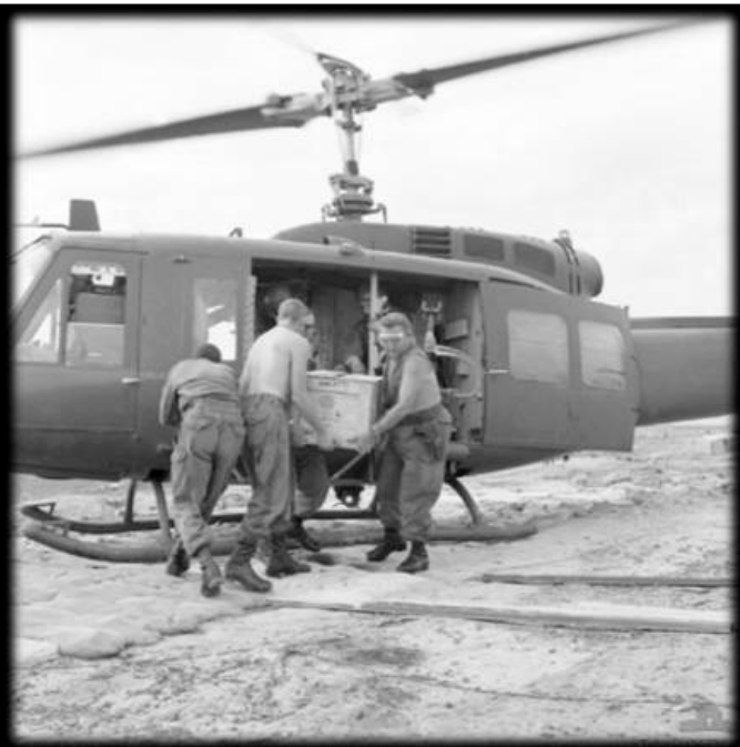
BIEN HOA PROVINCE, SOUTH VIETNAM, 1968-06. A RESUPPLY HELICOPTER IS BEING UNLOADED AT FIRE SUPPORT BASE (FSB) CONCORD IN NORTHERN BIEN HOA PROVINCE SHORTLY AFTER THE BASE HAD BEEN SET UP BY 4RAR /NZ (ANZAC) (THE ANZAC BATTALION COMPRISING 4TH BATTALION, THE ROYAL AUSTRALIAN REGIMENT AND A COMPONENT FROM THE 1ST BATTALION, ROYAL NEW ZEALAND INFANTRY REGIMENT). AT THE BASE WITH THE ANZAC BATTALION ARE ARMOURED PERSONNEL CARRIERS OF A SQUADRON, 3RD CAVALRY REGIMENT, HOWITZERS OF 104TH FIELD BATTERY, ROYAL AUSTRALIAN ARTILLERY (RAA), AND SELF PROPELLED GUNS OF AN AMERICAN BATTERY.