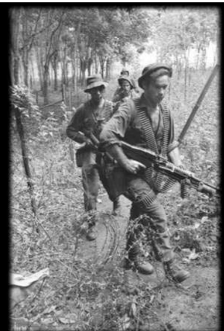
Nui Dat, South Vietnam, 10 November 1971. Returning to Nui Dat from their final patrol in Vietnam, these men of B Company, 4RAR /NZ (ANZAC) (The ANZAC Battalion comprising 4th Battalion, The Royal Australian Regiment and a component from the 1st Battalion, Royal New Zealand Infantry Regiment), were to move with their Battalion to Vung Tau prior to embarkation for Australia. The soldier leading is carrying a 7.62mm GMPG M60 machine gun and two belts of ammunition.