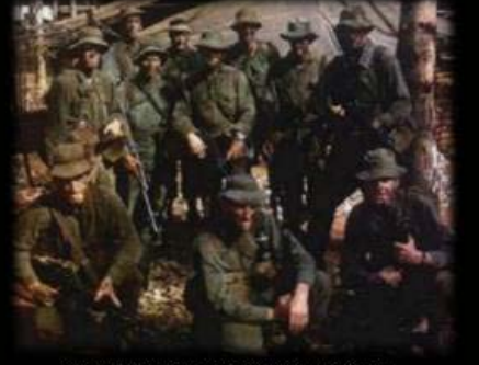
8 RAR IN THE LONG HAI HILLS 1970 A group shot of 9 Platoon after the ambush