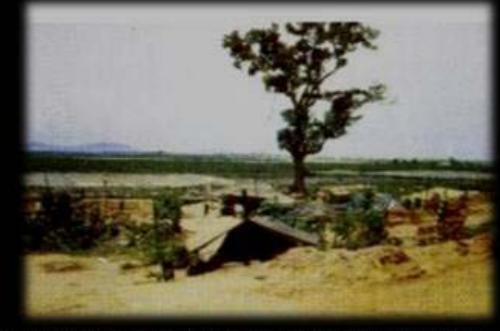
Fire Support Base Isa during Operation Hammersley showing the mortar section's area