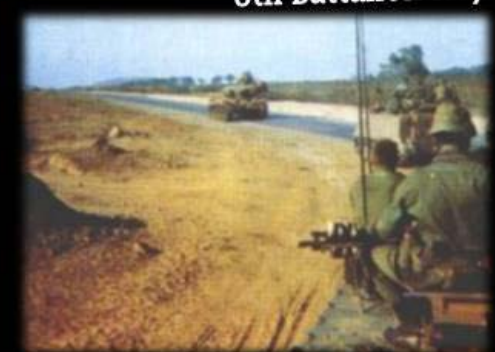
Above Picture: Operation Hammersley