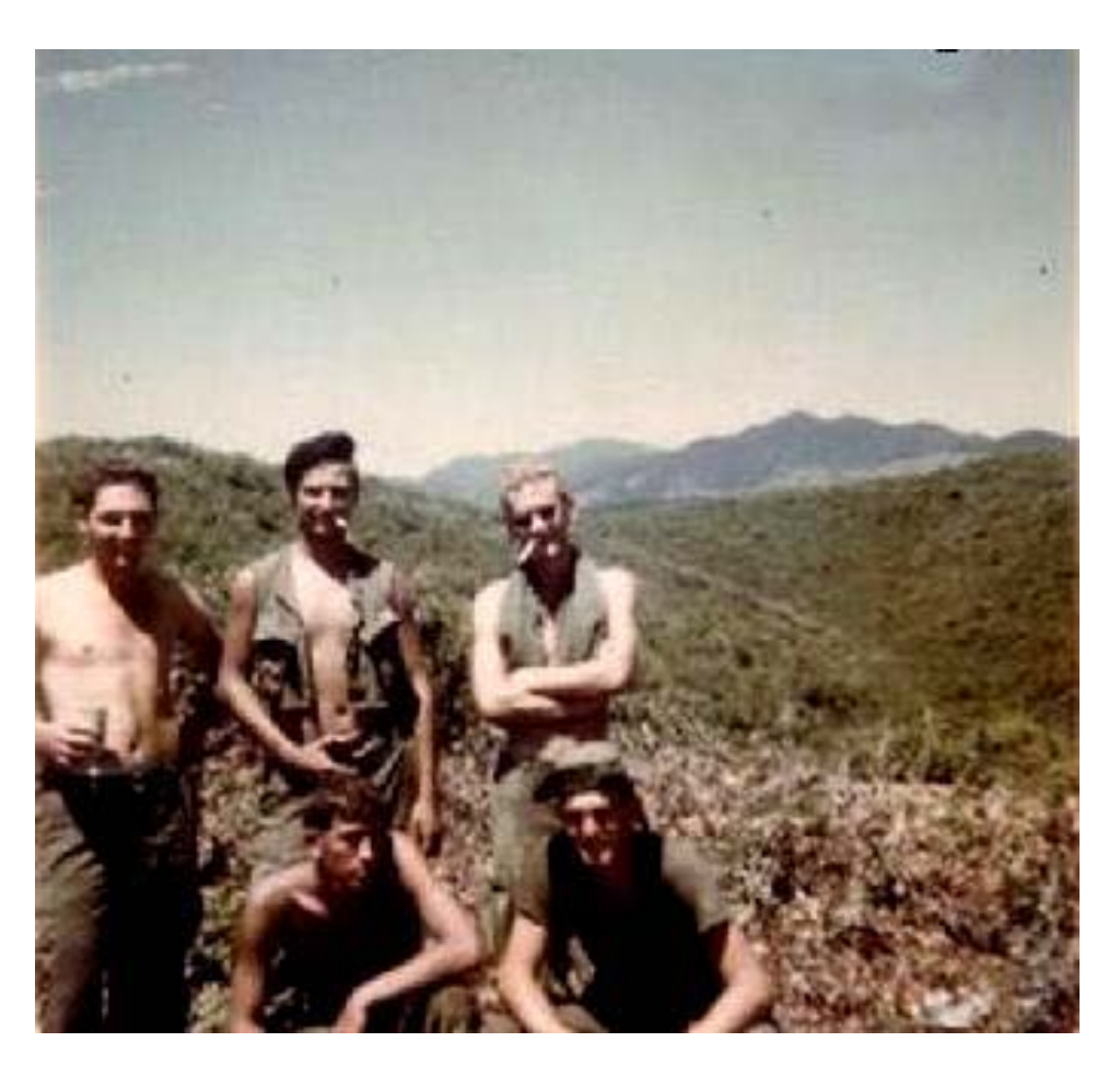
GREATER LOVE HATH NO MAN THAN THIS, THAT HE LAY DOWN HIS LIFE, FOR HIS FRIENDS" (John 15:13)